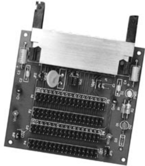
PCCextend 125 Card Interface Board (A150542-3) Order Number-125CIB