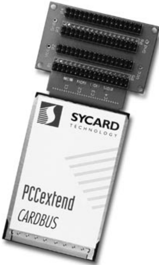
PCCextend 125 Host Interface Board (A150542-3) Order Number-125HIB